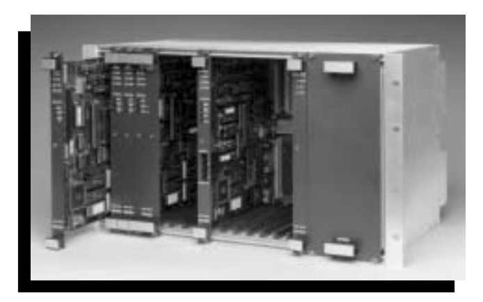
Digital T1 Interface.

When equipped with 4 Hex Trunk cards, the Digital T1 Interface supports all 24 trunks on a T1 span. If less than 24 trunks are required (a partial T1 span), fewer Hex Trunk cards can be installed to support partial T1 connections at a reduced cost.